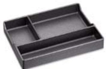
Base tray with 3 compartments

● possible *to special order For technical reasons sizes may sometimes vary from those as printed.