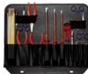
Tool panel CB3