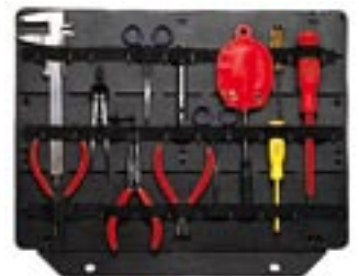
Tool panel CB6