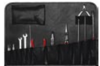
Tool panel CB5