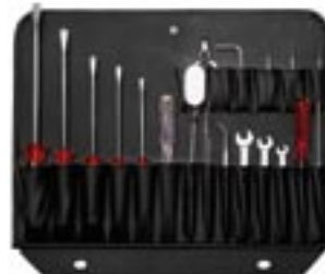
Tool panel CB1