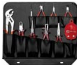
Tool panel CB2