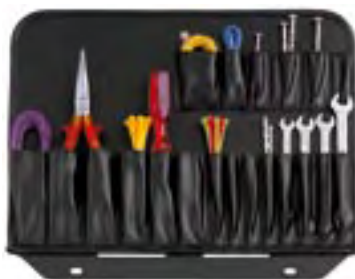
Tool panel MB1 for Megabag TC 1000