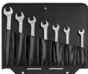
Tool panel MB3 for Megabag TC 2000 to TC 4000