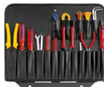
Tool panel MB4 for Megabag TC 2000 to TC 4000

Specially made combination padlock for extra security