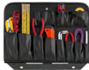
Tool panel MB2 for Megabag TC 1000