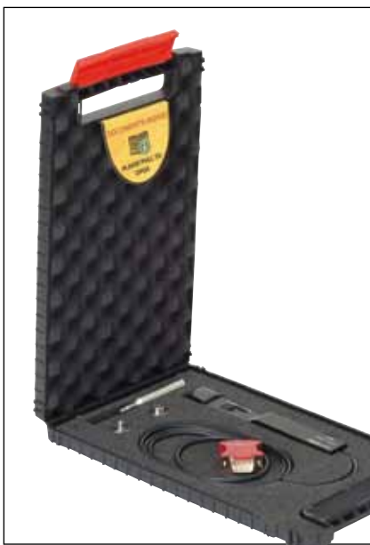
▲ sensors and accessories in the B 6691

Find the perfect case sizes also for instruments and measurement devices with small dimensions