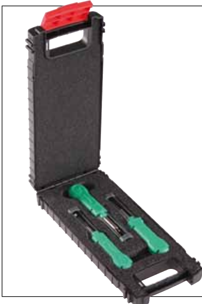
▲ releasing tools in the B 6361