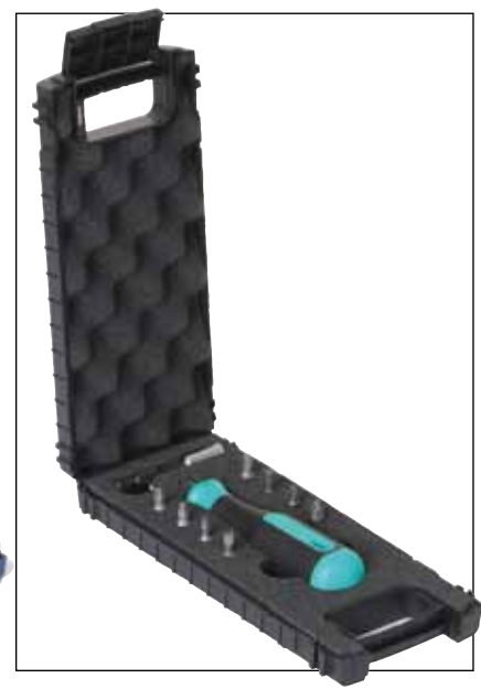
▲ bit set in the B 6361