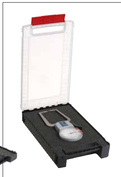
▲ mechanical external measuring gauge in the B 6692