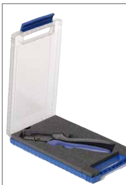
▲ crimping hand tools in the B 6691