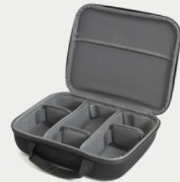
STA-300-B23 Case Black: Pouch & Divider