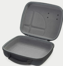
STA-300-B21 Case Black: Empty