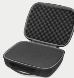
STA-300-B22 Case Black: with Foam